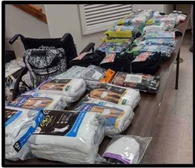
Left: new items table in February