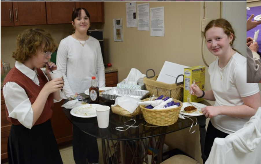
THANKS FOR SUPPORTING OUR YOUTH!