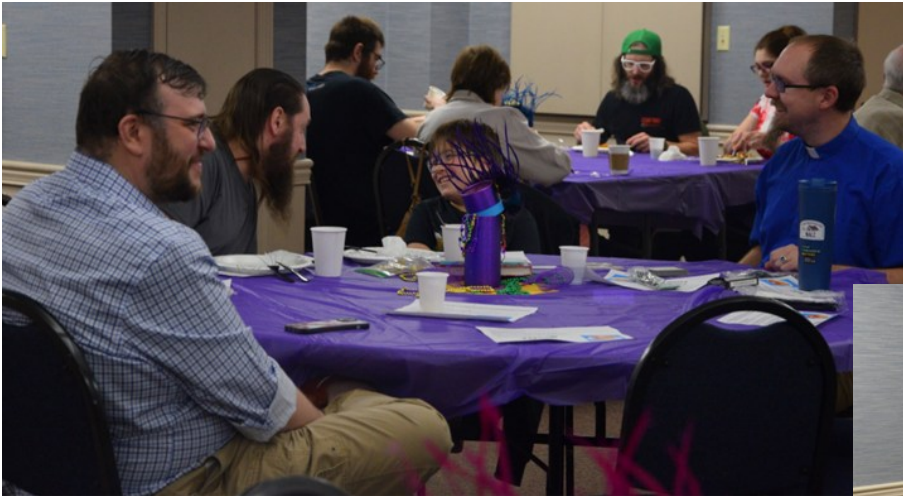
MARDI GRAS PANCAKE DINNER